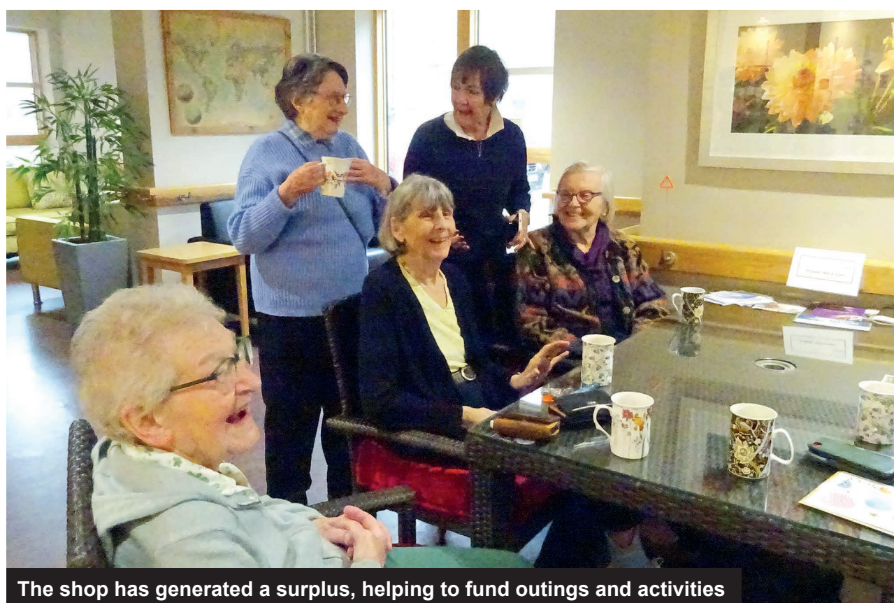
The shop has generated a surplus, helping to fund outings and activities

"An active and independent lifestyle in retirement was what I was looking for," she concludes "and that's certainly how it's been for me so far!"