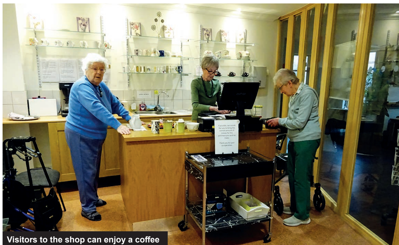
Visitors to the shop can enjoy a coffee