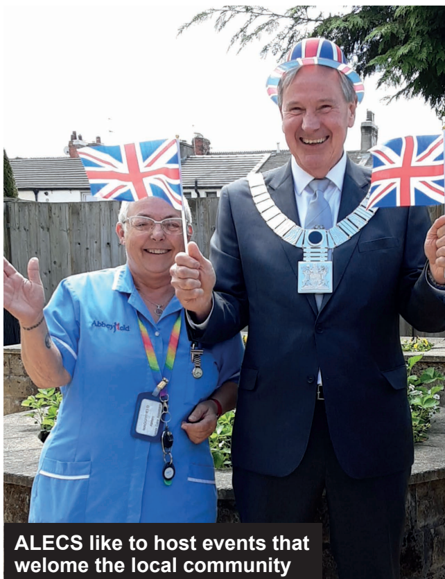
ALECS like to host events that welcome the local community

"Some of the groups are happy for residents to drop in and out, but those that