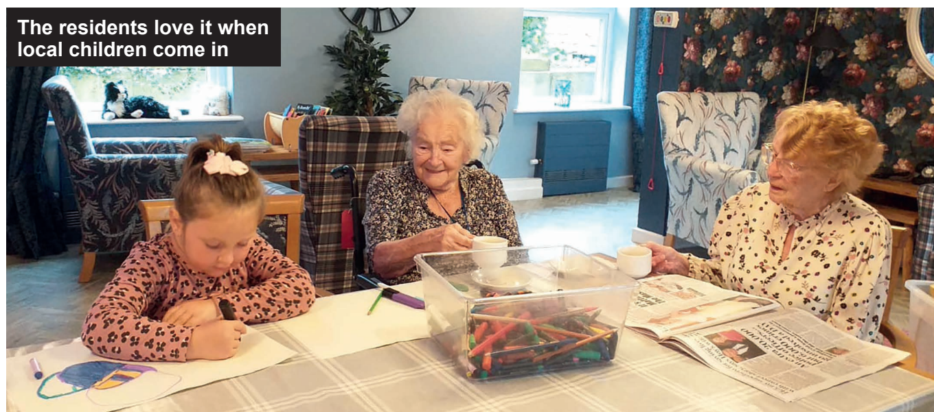
The residents love it when local children come in

"The best part of my role is going into the home and feeling the buzz, the warmth and the friendliness. We have great staff, super trustees and a lovely atmosphere."