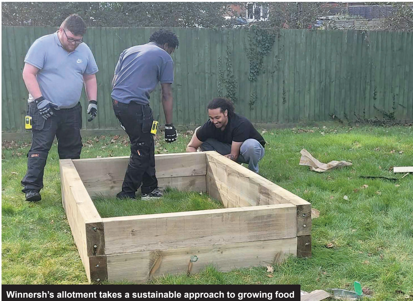
Winnersh's allotment takes a sustainable approach to growing food

A promising new initiative is taking root at Abbeyfield Winnersh, with a new allotment being built in the home's grounds, which will provide fresh, homegrown vegetables and herbs for the kitchen, promoting a more sustainable and cost-effective approach to meal preparation. Unused grounds have been repurposed to create the space, generating a useful and engaging area where residents can get involved.