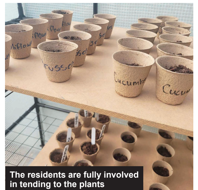
The residents are fully involved in tending to the plants

"It's all about making memories, expressing emotions and, more importantly, feeling safe in each others' company."