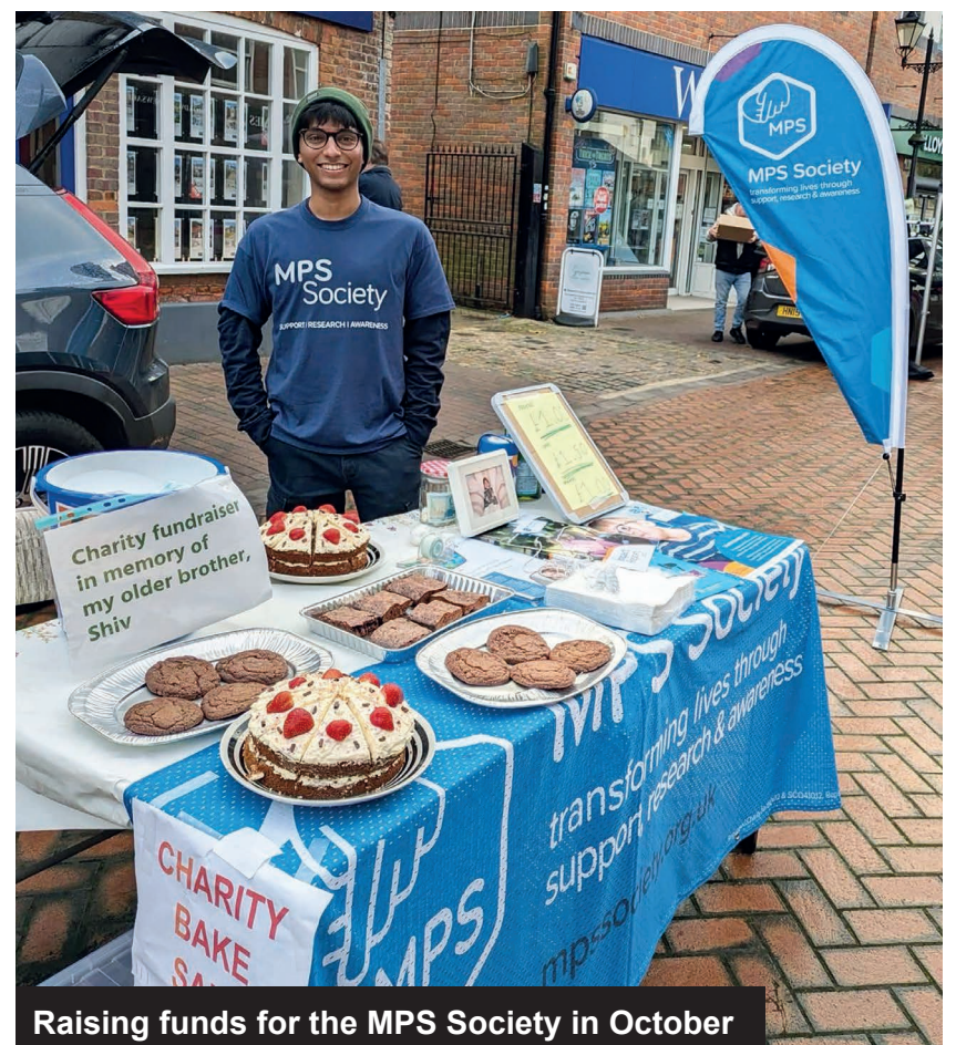
Raising funds for the MPS Society in October

"I organised a stall at Chesham market in October, raising a few hundred pounds selling my home-made baked goods. The bakery across the road were impressed with my sales technique and even offered me a job, which was