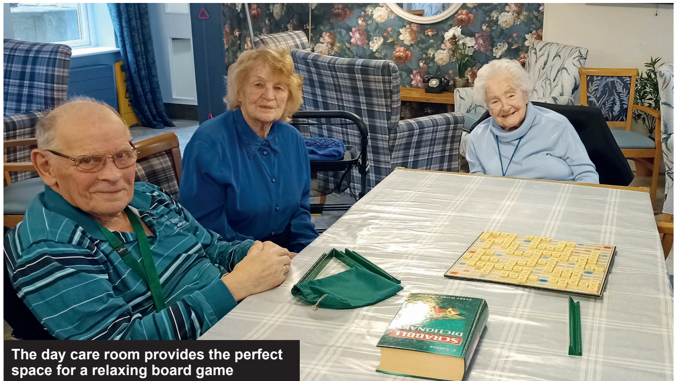
The day care room provides the perfect space for a relaxing board game